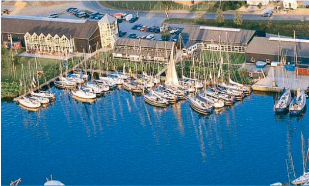
X-Yachts - the yard in Haderslev, Denmark.