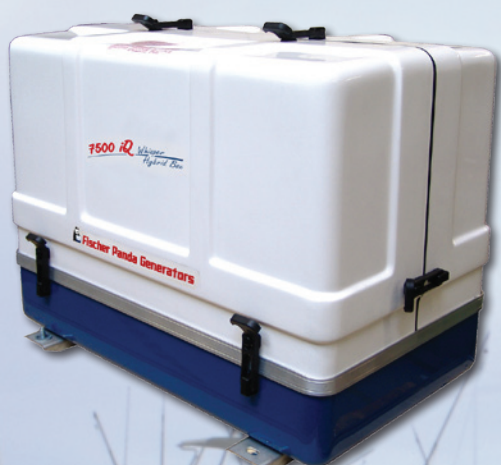
Panda 7500iQ Whisper HybridBox

At the Marine Equipment Trade Show (METS) in Amsterdam, The Netherlands, Fischer Panda introduced a new 'all in one' power supply solution: the Panda 7500iQ Whisper HybridBox. This compact unit combines a modern variable-speed generator with a shore power connection and efficient battery charging. Inside the HybridBox a Quattro 24/3000/70 is installed, which provides 230 Volt under the most adverse circumstances.