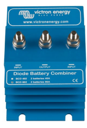
Argo Diode Battery Combiner BCD 802

Diode Battery Combiners are used to guarantee continuous DC power to mission critical equipment, such as an electronic engine control system. With a diode battery combiner two or more DC power sources can be used in parallel to supply the mission critical load. Failure of one source will not interrupt power to the critical load.